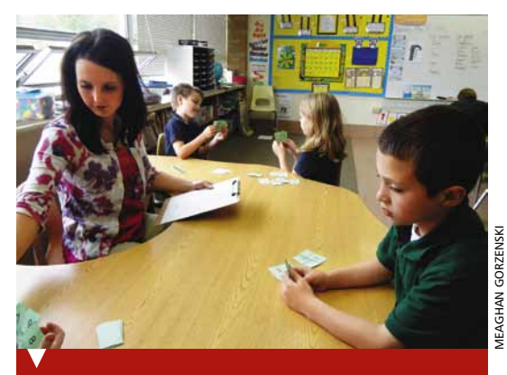
As students turn over cards, observe to see and hear how efficient each student is as well as whether he or she chose an appro priate strategy or just knew.