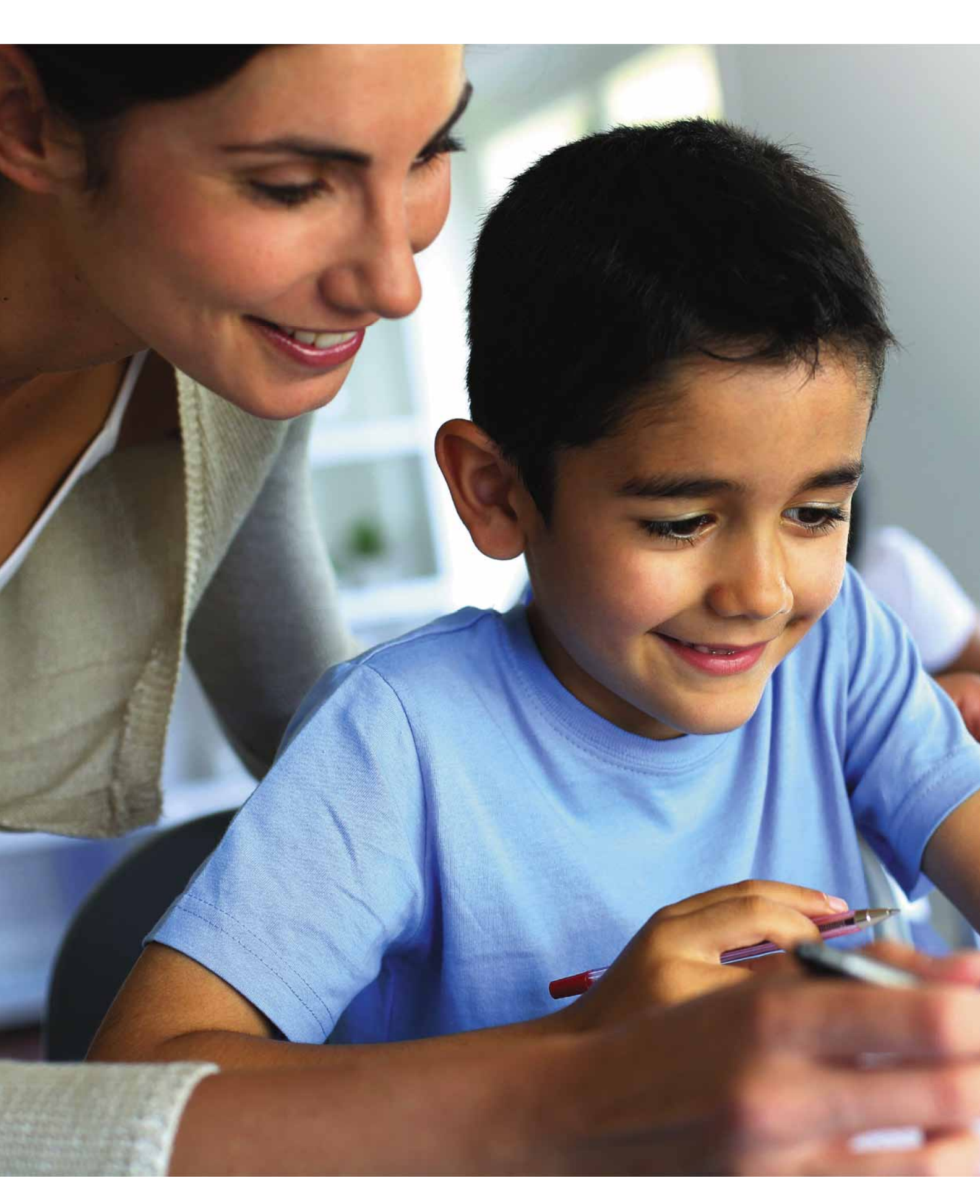
488 April 2014 • teaching children mathematics | Vol. 20, No. 8