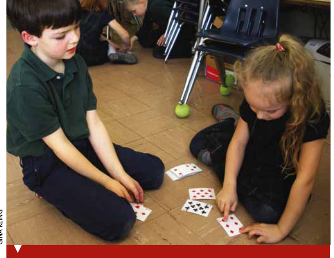
Adopt more flexibility and variety in how you assess students' basic fact fluency.